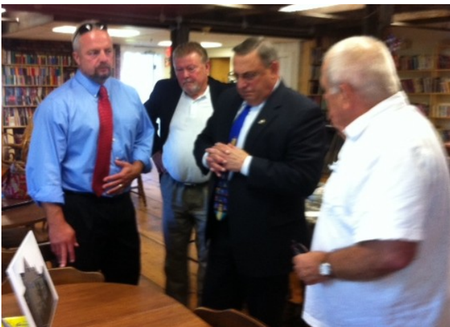
On July 31 Maine Governor Paul LePage made a brief visit to the NDI campus as the guest of York County Shelter. He left greatly impressed by the professional and efficient operation, taking with him ideas for improving State social service operations.